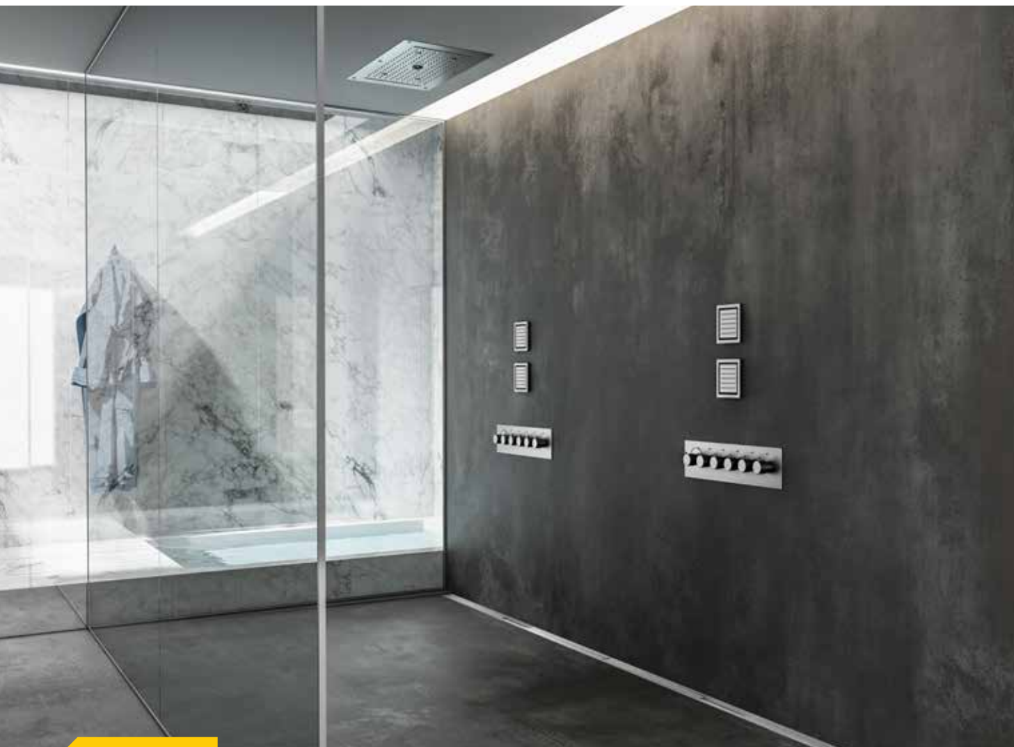
IN THE DETAILS