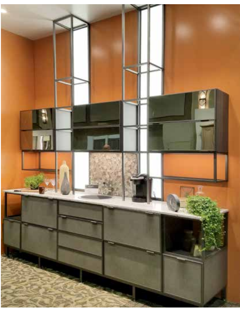
Element Designs' products are virtually fail-proof when properly installed.